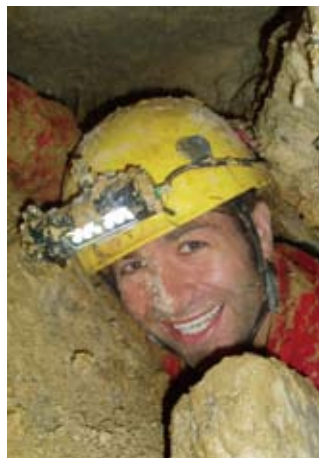
ABOVE RIGHT. Connection tunnel breakthrough, Ruakuri Cave.