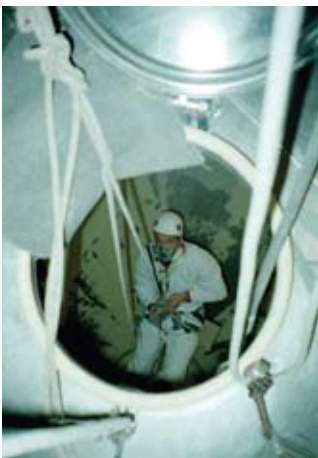
ABOVE LEFT. Dairy vessel inspection, Tirau.