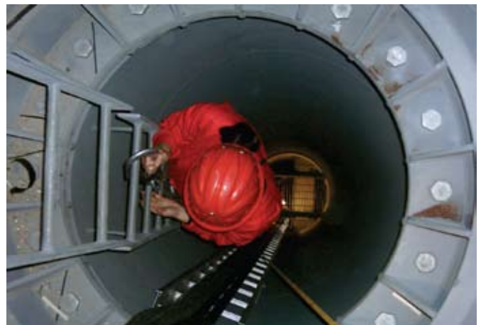
ABOVE. Access to lighting tower, Waikato Stadium.