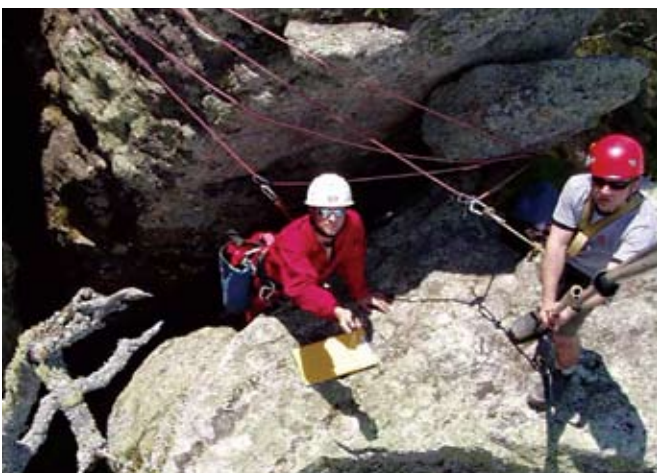
ABOVE. Block stability investigation.